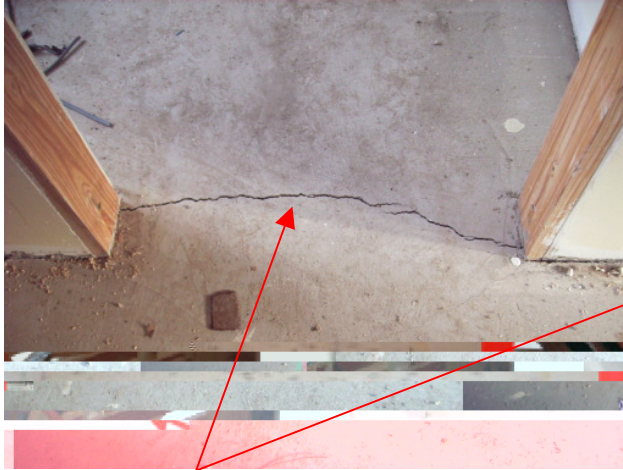
No expansion gap from room to room!

(Normally there should be a 10-15mm PE-insulation-stripes between concrete-floor and wall)