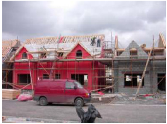
Stone-houses (concrete-blocks) are also a real 'worst-case'!