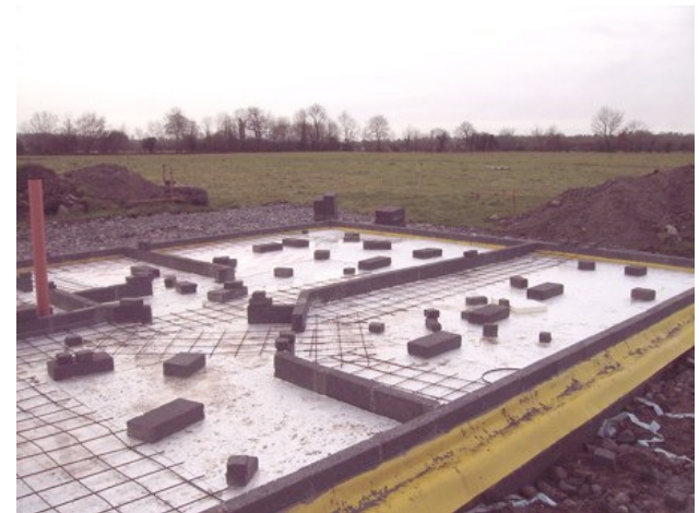
“Funny”! – Some builder make the last screed before walls & roof – a wet floor for years and mould later on is no problem – they said! Auah!